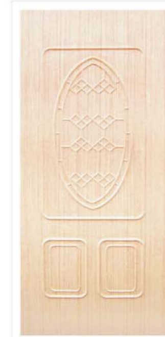
DS 08 Sandalwood