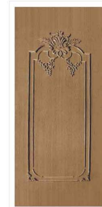
DS 07 Walnut