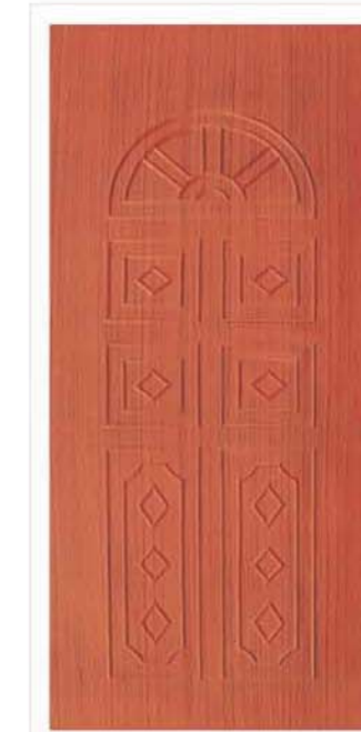
DS 02 Rosewood