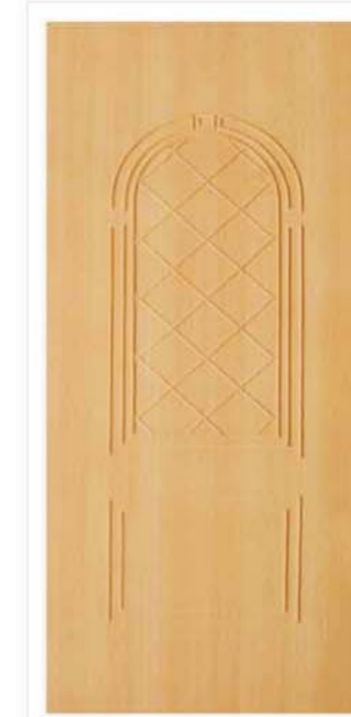
DS 01 Beech