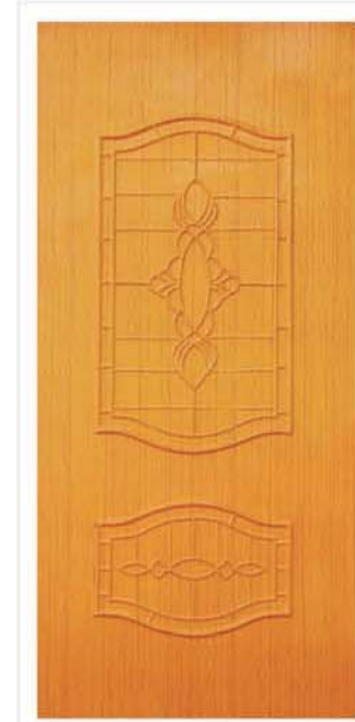
DS 10 Teakwood