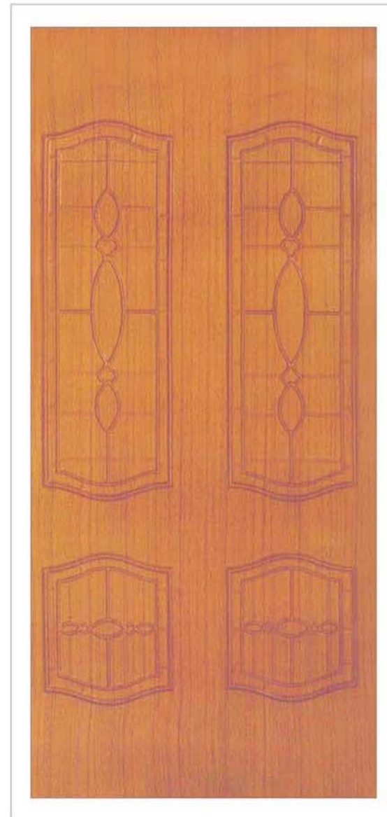
DS 11 Teakwood