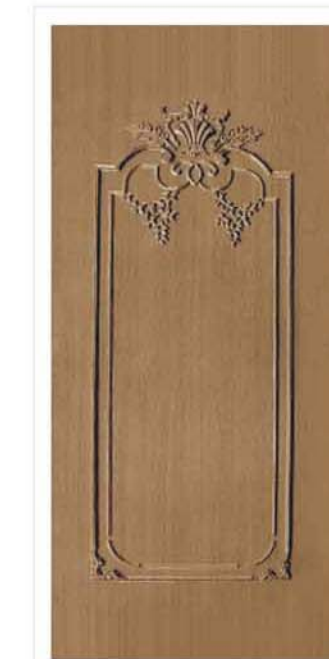
DS 07 Walnut