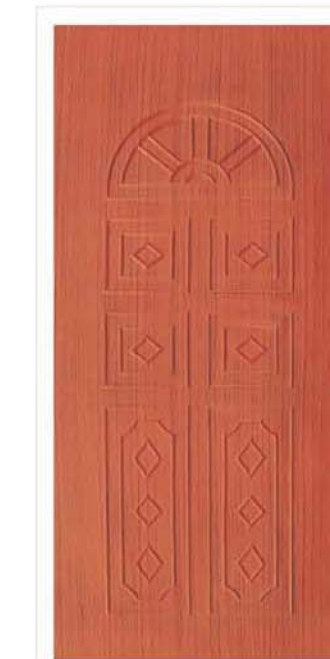
DS 02 Rosewood