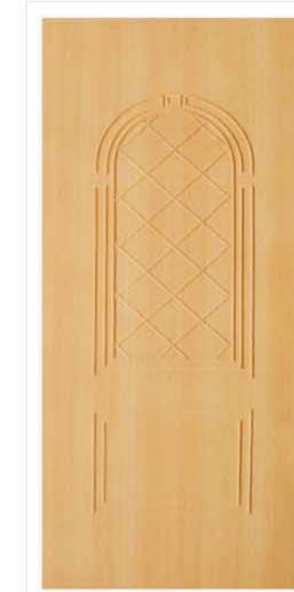
DS 01 Beech