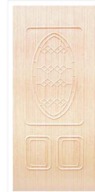
DS 08 Sandalwood