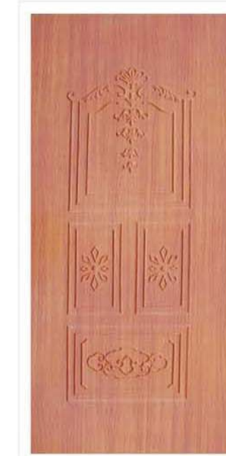
DS 04 Natural Teak