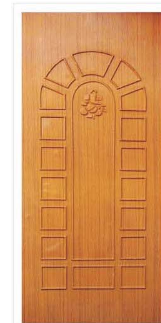
DS 05 Teakwood